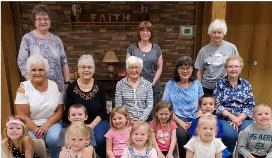
“Hot Muffins” ladies with Little Blessing kiddos after exercise class!

Class of 2022 with their beautiful quilts sewn by the Do Day ladies!