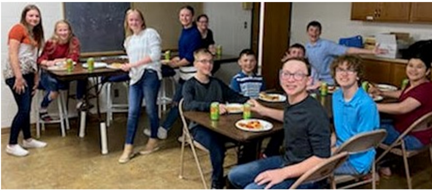
Confirmation students enjoying pizza after serving the “Spring Splash”! They did an awesome job!